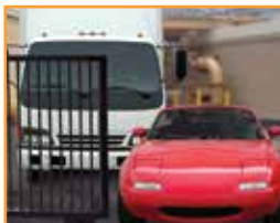
partial open open gate short distance for cars or open fully for trucks