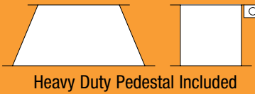
Heavy Duty Pedestal Included