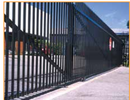
large gates up to 3000 Lbs