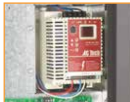
variable speed motor drive