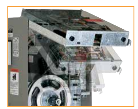
unique design allows easy access to all mechanical parts