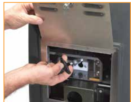
easy to use "T-Handle" release