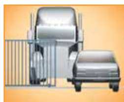
adjustable partial open for different opening distances