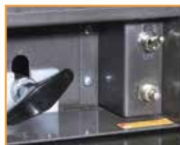
built in power switch and reset switch