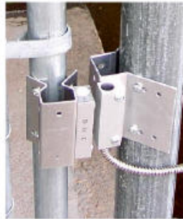
8450-3 Combination Post Mount