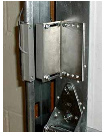
8299-G Industrial Track Mount