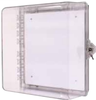
STI-7530 with Key Lock