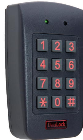
Red Backlit Keypad

Capacity: 500 users, single/dual code for each Keypad: 3x4 keys for local programming and 4 to 8 digit PIN code entry User Levels: Normal/Secure/Master