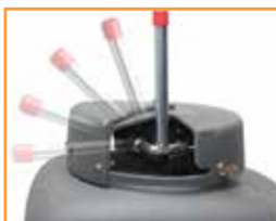
simple manual release