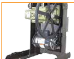
steel frame for strength and durability