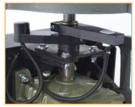
easily adjustable electronic magnetic limits