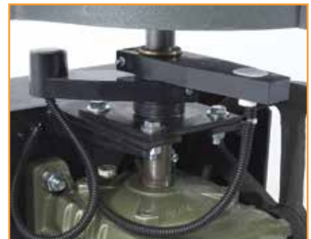
easily adjustable electronic magnetic limits