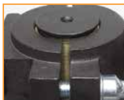
breakaway hub prevents gearbox damage