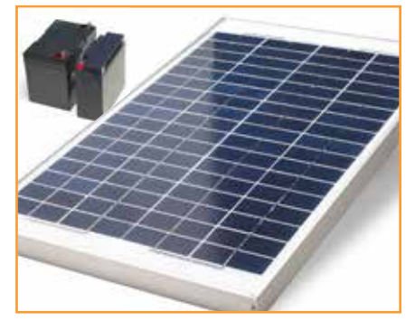
solar powered panel and battery options available