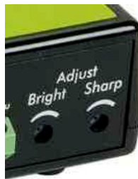
Figure 3: Brightness and Sharpness Adjustment