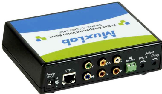
Figure 2: Receiver