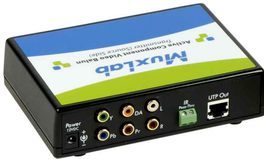
Figure 1: Transmitter

The external connections and diagnostic indicators of the Active Component Video Balun are described on the following pages. Please familiarize yourself with them before proceeding with the installation.