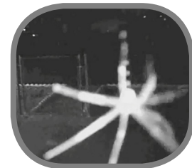
Spider/Insect Alarm Reduction