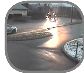
Car Headlight Alarm Reduction