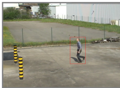
Standard default parameters for easy setup covering the majority of scenes