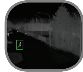
Thermal Camera Support