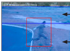
Detect objects with 'conflicting' criteria in the same scene