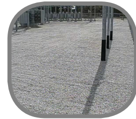
Sterile Zone Application