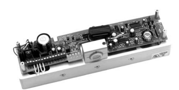
3006 Without Cover

Desktop, slope front and rack mount fabricated to customer specifications.