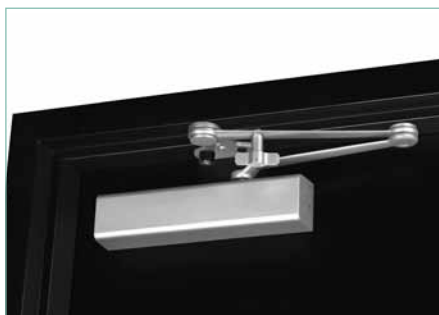
HDH arm (with stop) shown