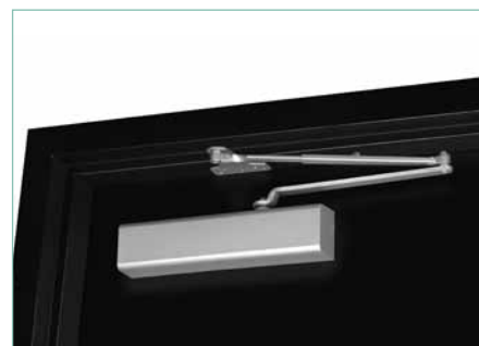
TPN arm shown (parallel mounting)