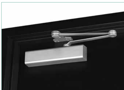
HDN arm (without stop) shown