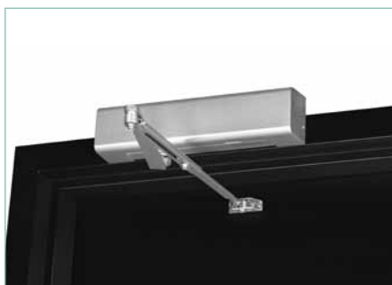
TPN arm shown (top jamb mounting)