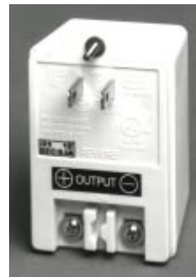
8065 Class II U.L.

GEORGE RISK INDUSTRIES, INC. G.R.I. PLAZA KIMBALL, NE 69145