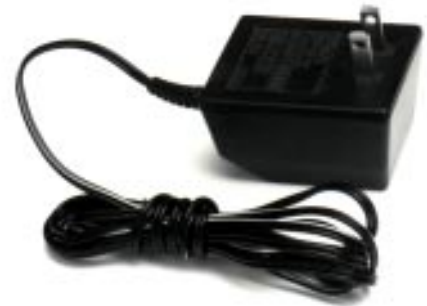
6973 UL Listed E152985(S)