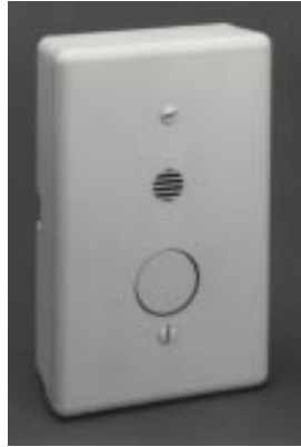
Surface Mount Button and Sounder