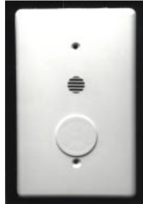
Recessed Sounder Only