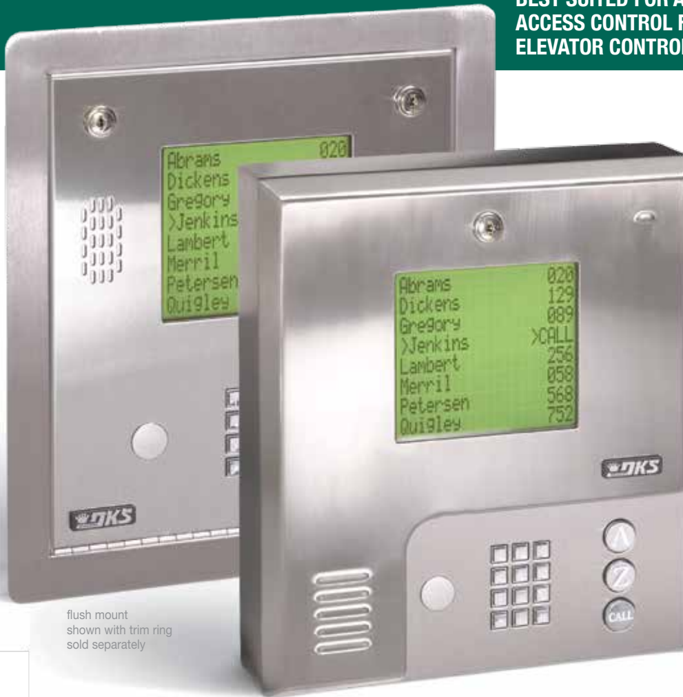
flush mount shown with trim ring sold separately

BEST SUITED FOR APPLICATIONS REQUIRING COMPLETE ACCESS CONTROL FOR UP TO 16 ENTRY POINTS, INCLUDING ELEVATOR CONTROL