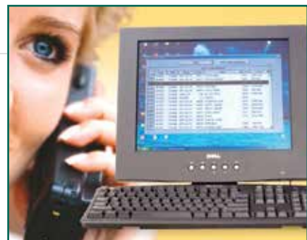
pc programmable easy to use Remote Account Manager software included