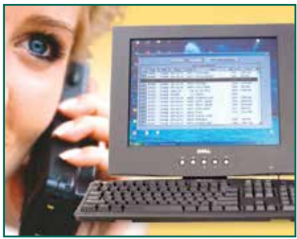
pc programmable easy to use Remote Account Manager software included

stainless steel plate and anti-vandal features