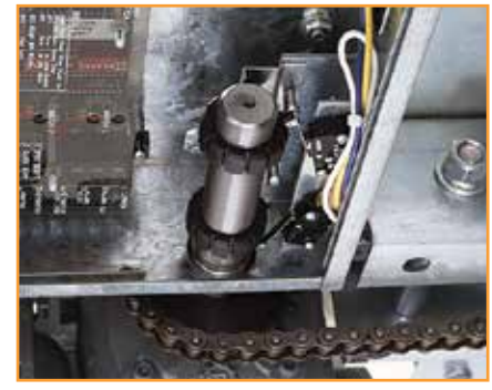
direct drive limit switches easily adjustable and don't need to be reset after power outage