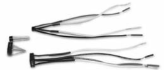
10R1, 10R1-6, 10R3, 10R3-6 Bridge Rectifiers