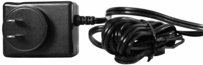
T1003 Plug-in Power Supply