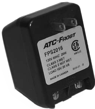
T1002, T1004, T1008 Plug-in Transformers