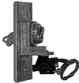
CX-1085 (MOUNTED TO KEY SWITCH)

Camden CX-1085 Pneumatic Timer is integrated into the CM-1285, 2285, 3285/3585 and CM-1185/2085 Key Switches.